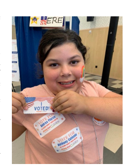
Kids voted for Clark County Youth Mayor!