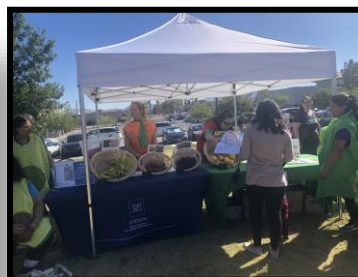
UNR Farmers Market!